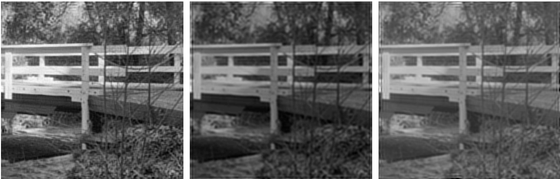
Figure 3: Reconstructed image using the Neumann boundary condition (left), the zero boundary condition (middle) and the periodic boundary condition (right).